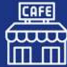
Gazebo / Cafe