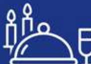
Candle Light Dinner