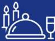
Candle Light Dinner