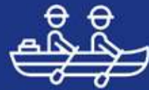
Boat / Theppa Ride on request (Additional Charges)